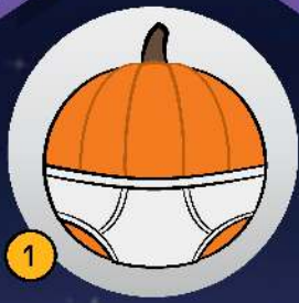
1 Attach Tighty-Whities to the pumpkin; tighten any slack with rubber-band in the back