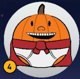
4 Paint over pencil marks with black and white paint as shown above – let dry