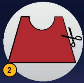
2 Cut red fabric into cape-shape and tie around pumpkin (as shown in picture). Remember to supervise your little ones when using scissors.