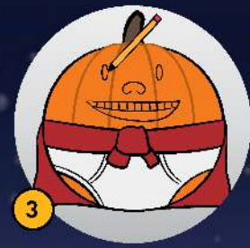
3 Lightly draw eyes, eyebrows, nose, mouth and ears with a pencil on pumpkin